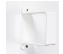
▲ Protection against Wall