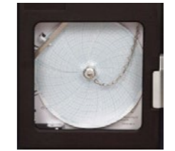
▲ 7-day circular chart recorder is Optional