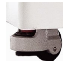
▲ Heavy-duty caster with lock