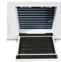
▲ Washable filter