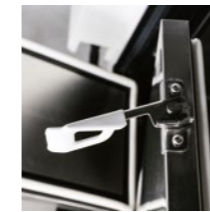
▲ Insulated inner door with latch

Easy-to-remove washable filter provides protection from dust on the condenser, increasing refrigeration performance.