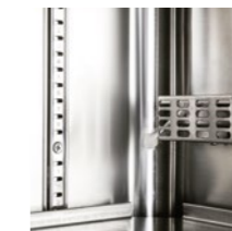
▲ SS304 inner cabinet, figure marked strip and sensor