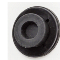
▲ Testing port