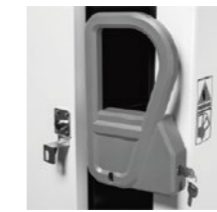
▲ SS304 inner door latch