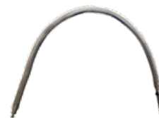
Vacuum jacketed hose